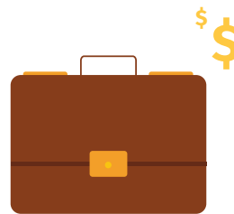
Creating more jobs