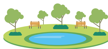
Supporting safe and healthy communities