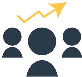
Planning for an increase in population

In Manitoba, The Planning Act directs that a regional plan must be prepared to look 30 years into the future. It builds on local planning by helping communities make smart, connected choices for roads, water, housing, and services that benefit the whole region, not just today, but for the next generation.